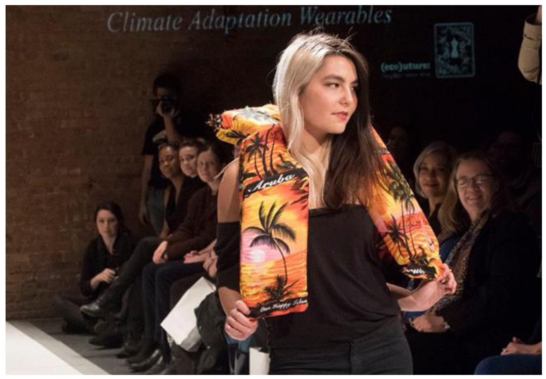
FIGURE 1 Lifejacket for Aruba, an Island country drowning due to climate change.