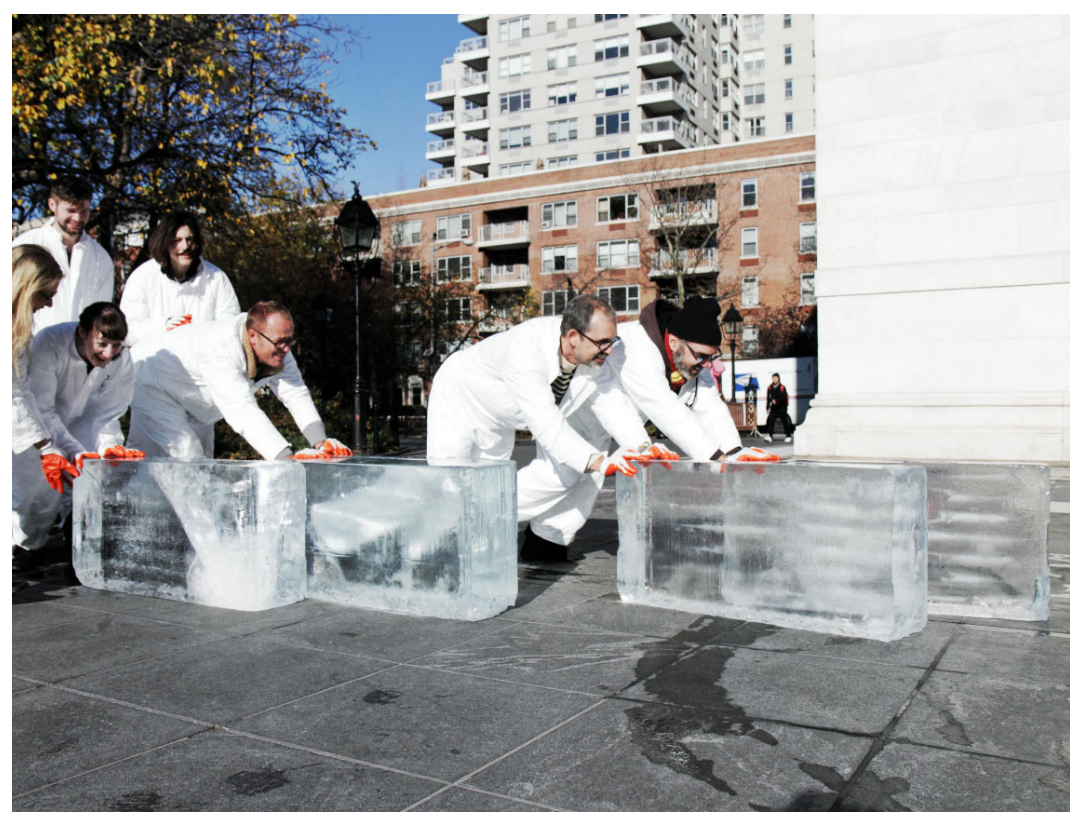
FIGURE 4 "Climate deal now!" Writing with melting ice in NYC in December.

To involve students in the environmental problems of the icy cryosphere and the invisible atmosphere is a challenge. Building ice sculptures would not do the trick unless they melt in a meaningful way. Ice is a material that is less stable and controllable in the classroom, making it unattractive for educational purposes. But we tried, and the result came in the format of a film in which we used large ice cubes to write a message of support for the Paris Climate Agreement. That ice would melt next to the traditional Washington Square Christmas tree was, to us, a message in itself, and we put it on display by writing "Climate Deal Now!" by pushing large ice cubes along the square slowly enough to mark the ground with meltwater. Not a particularly impressive design, but nevertheless fun and engaging for students seeking to make an impact.