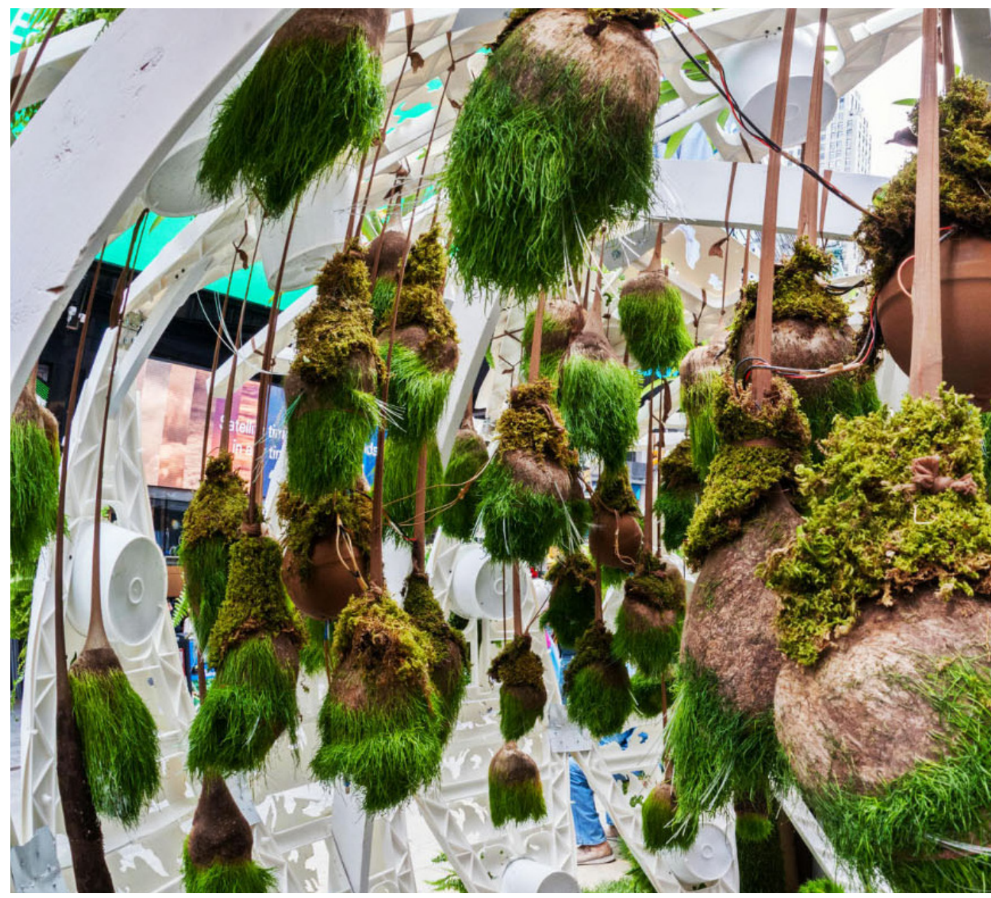
FIGURE 5 Inside Times Square Electronic Garden with Suspended Grassy Balls for Motion and Sound Interaction

We had great fun creating these; filling the stockings with earth and grass seeds, and watching them grow into lush green hanging lawns. The idea behind them was a group of mostly female NYU master students in engineering. When massaging the balls, they would make squeaky sounds of pleasure, which grass expressed (they imagined) in the sounds of gurgling water. The engineering behind it was extraordinary in the merging of the natural and artificial of what became an 'electronic' garden. A symphony of water sounds from dripping to splashing was what visitors heard when squeezing, touching, or rubbing down our forest of hanging grass balls. They became species with needs and desires for us to please and respect. The hidden speakers and live sensors among the plants were supposed to connect to our URL. At least that is what we tried to convey