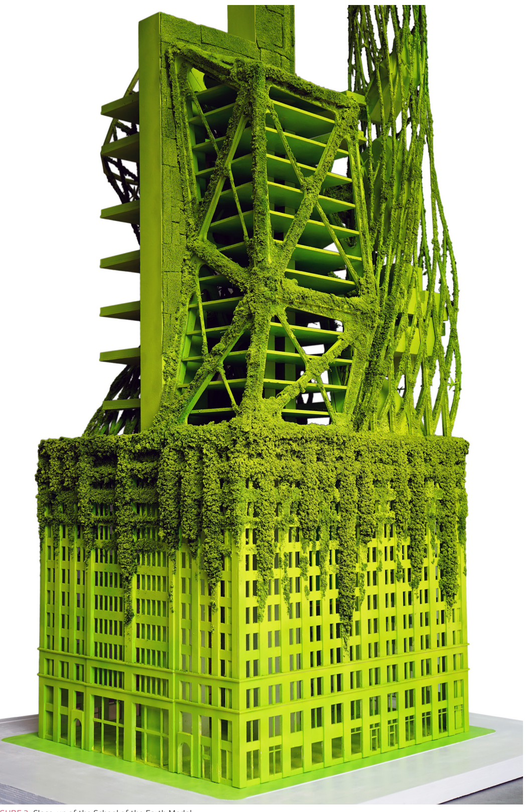
FIGURE 3 Close-up of the School of the Earth Model.