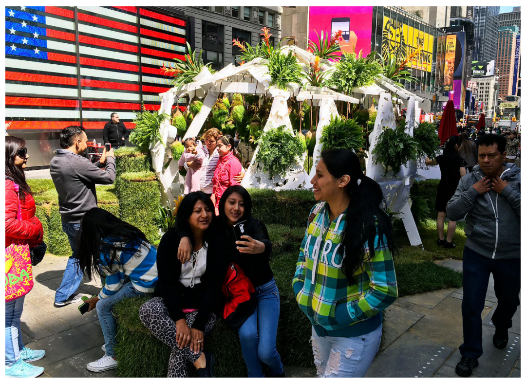
FIGURE 6 Times Square Electronic Garden.